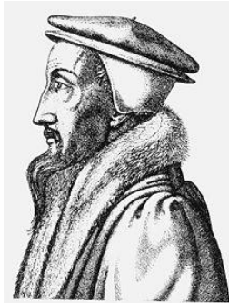
John Calvin at age 53 (from an engraving)